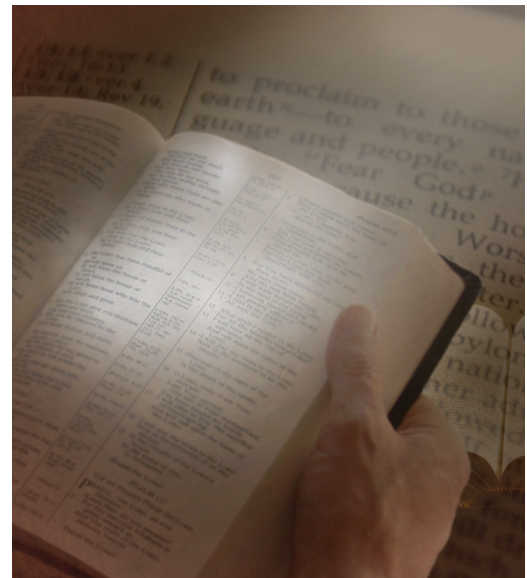
The Bible is the ultimate authority.